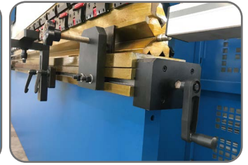
Manual Crowning System-Optional