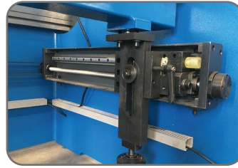
BackGauge with Linear guide