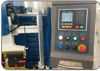
Estun E21 NC Control System